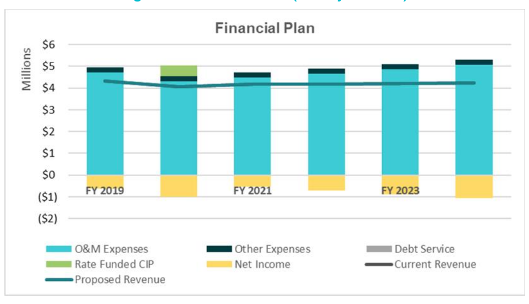
Figure 2-1: Financial Plan (No Adjustments)

Figure 2-1 shows the financial plan in graphical format – derived from Table 2-10 . The blue bars represent the O&M expenses, which include water supply costs. The dark blue bars represent all other expenses, and the rate funded capital costs are shown as green bars. The yellow bars, which represent net income, are negative for all study years, signifying that the Agency is drawing down reserves for all years. The teal line shows current revenues without revenue adjustments, which are not sufficient to fund all operating and capital costs.