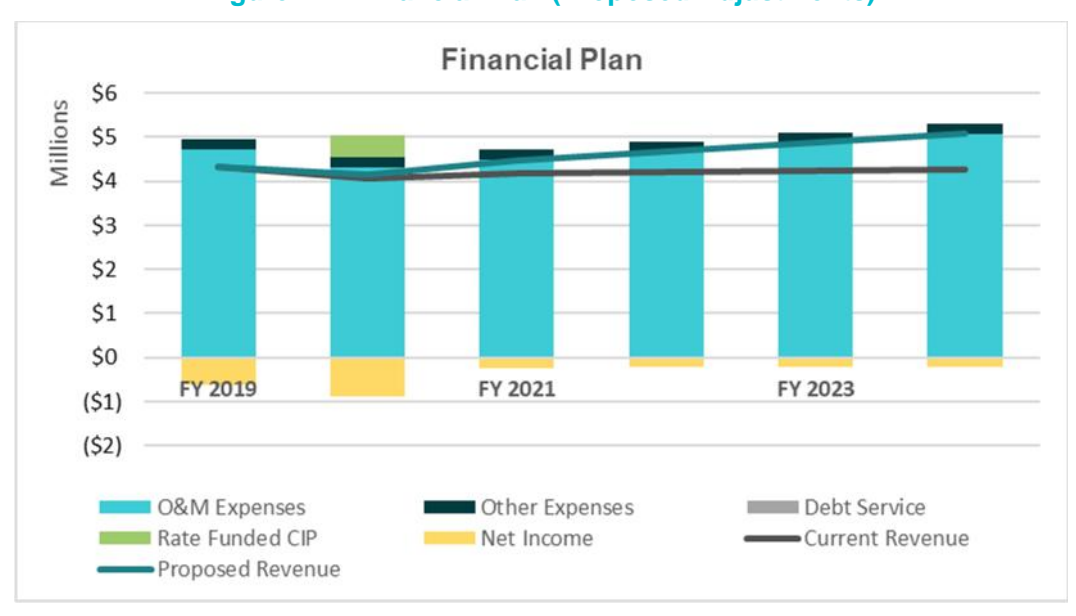
Figure 2-4: Financial Plan (Proposed Adjustments)

Figure 2-4 shows the financial plan with proposed revenue adjustments from Table 2-13 . The net income, shown as yellow bars, is slightly negative for the study period.