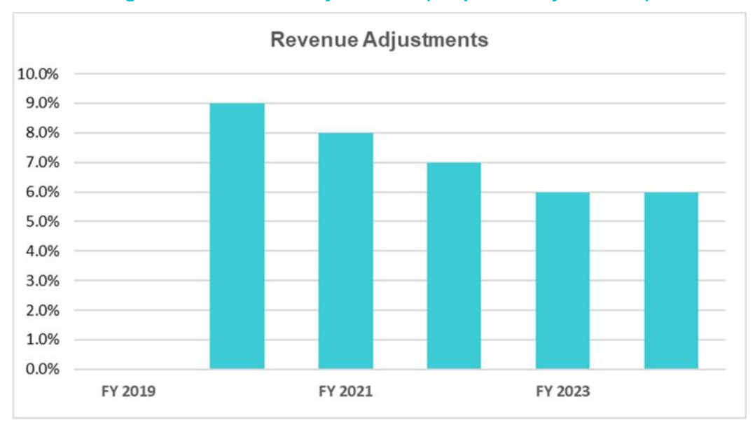
Figure 2-3: Revenue Adjustments (Proposed Adjustments)

Figure 2-4 shows the financial plan with proposed revenue adjustments from Table 2-13 . The net income, shown as yellow bars, is slightly negative for the study period.